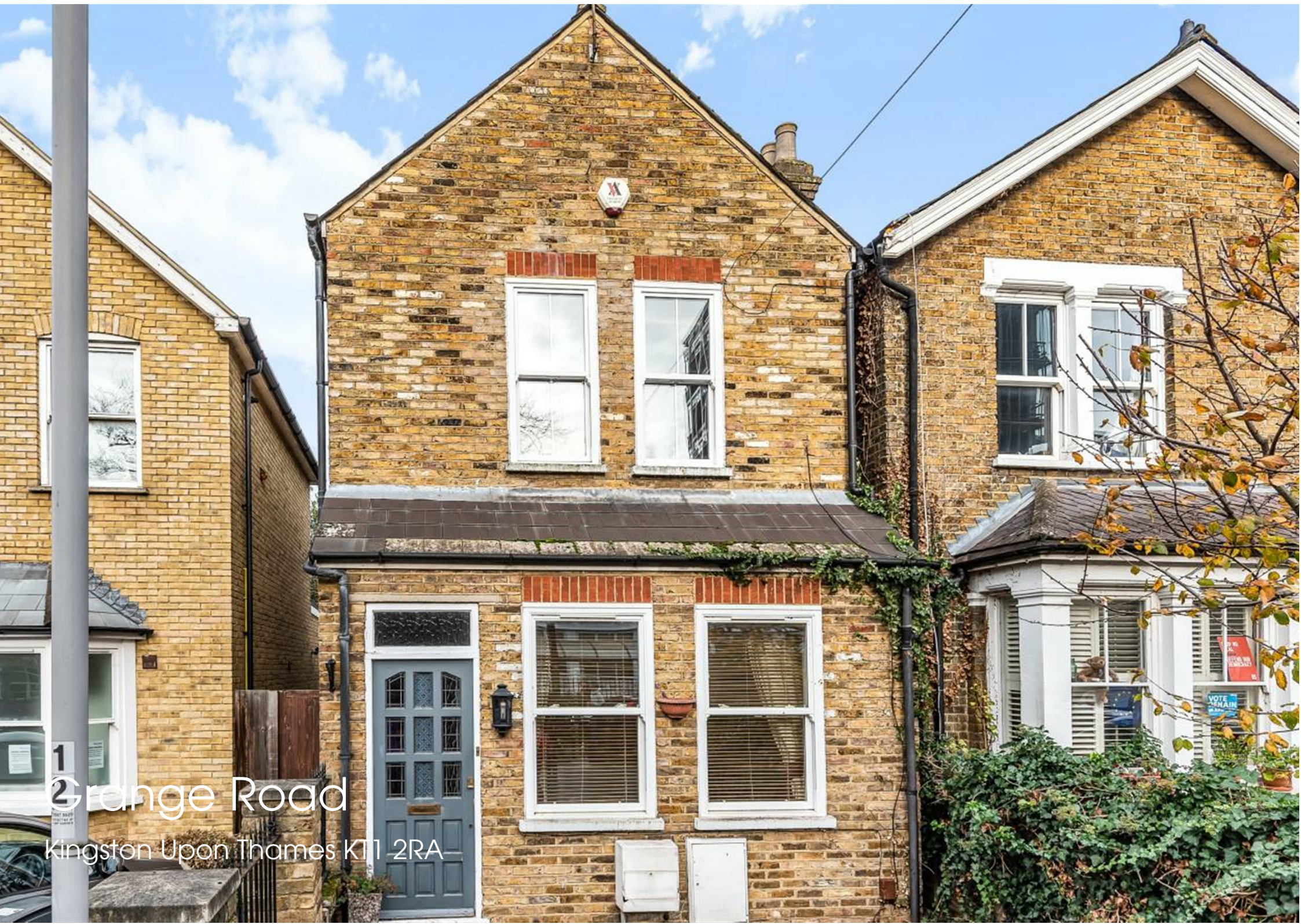
1 Grange Road Kingston Upon Thames KT1 2RA

34 Richmond Road Kingston upon Thames Surrey KT2 5ED www.gibsonlane.co.uk Tel: 020 8546 5444